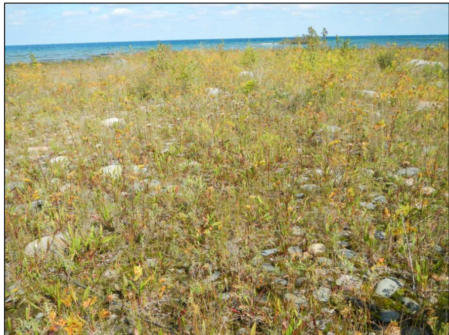
Figure 6. View of project area near the shoreline looking out into Lake Huron (note the lack of any suitable sandy areas).

As for the Eastern Massasauga, no individuals were seen and no habitat exists within the zone surveyed. For the Lake Huron locust, no sand features are present within the zone surveyed (Figures 6 and 7), and therefore no habitat is available for this species here. Our findings suggest that the proposed project will likely have no significant impact on any of the three rare animals mentioned above.