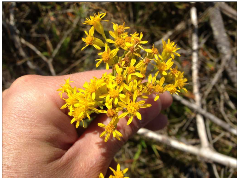
Figure 2. Houghton's goldenrod ( Solidago houghtonii ) at HBBS. This species can be distinguished from the more common Ohio goldenrod ( S. ohioensis ), also present at the site, by its larger rays and scabrous-hispidulous pedicels (not shown).

Two other listed vascular plant taxa, the federally and state threatened Pitcher's thistle ( Cirsium pitcheri ) and the state threatened Lake Huron tansy ( Tanacetum bipinnatum [ T. huronense ]) have also been reported from the vicinity of HBBS, although neither species was documented during the meander surveys. Both species prefer open dunes and sand beaches, habitats which primarily occur S and W of HBBS outside the project zone. No other federal or state listed vascular plants were observed within the project zone. A Floristic Quality Assessment (Reznicek et al. 2014) including a list of vascular plant species is included in the Appendix.