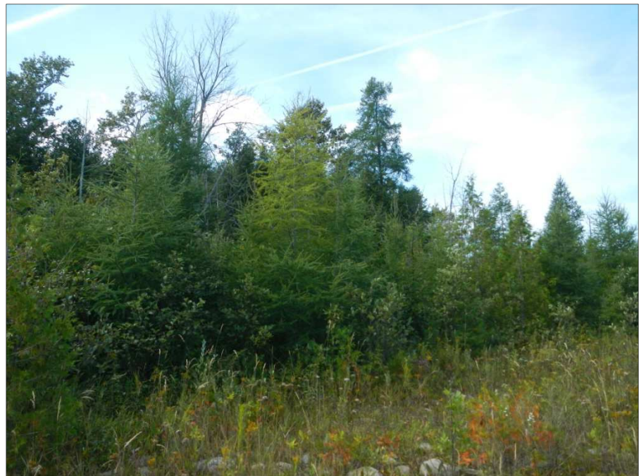
Figure 4. View of project area from the shoreline looking to the northwest.

Surveys were conducted on 18 September 2014 and no rare animals were observed during the visit. Specific to the Bald Eagle, no trees were even large enough to potentially support an eagle nest (Figures 4 and 5) and so there will be no impact to this species in the proposed project area.